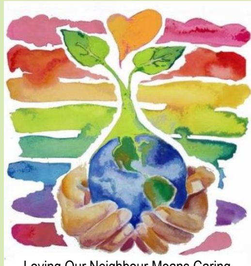
Loving Our Neighbour Means Caring For God's Creation

There are around 50,000 local congregations in the UK – worshipping communities in nearly every village, town and city neighbourhood. The majority have expressed the will to cut carbon emissions. If only a quarter of the UK's three to four million churchgoers adopted low carbon lifestyles and committed to speaking up for change – in their workplace or by raising issues with their MPs for example – it would accelerate change in business and politics at the national level. Local churches showing by their changed lifestyle and willingness to speak up will be the most powerful demonstration of what whole sectors of society could do. They – We could deliver change and hope beyond our earthly expectations.