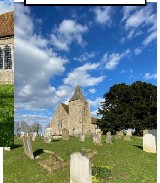
St Augustine – Snave